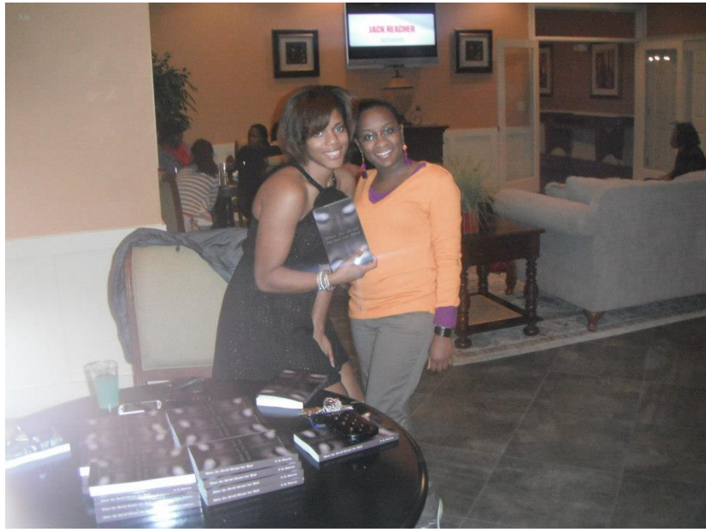
Release party: December 2012