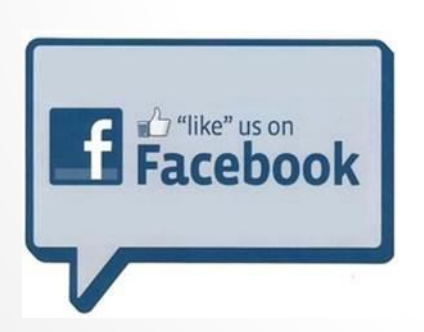
@ImpressumSchool of SocialGraces